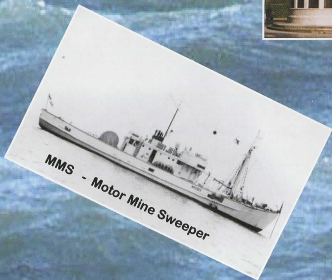
MMS - Motor Mine Sweeper