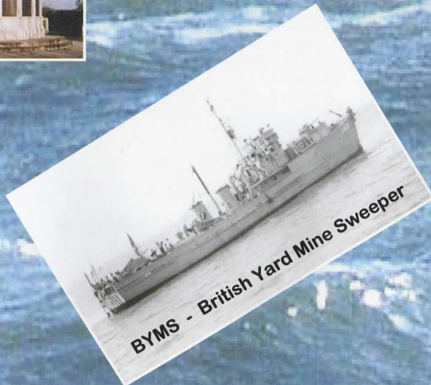
BYMS - British Yard Mine Sweeper