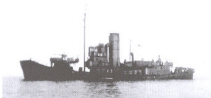
HMS Cocker at anchor

Should we not know the truth of Gloxinias failure to assist in the rescue.