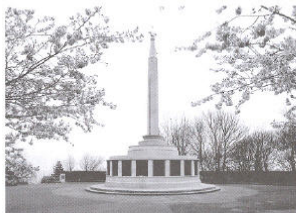
The memorial framed by pink blossom