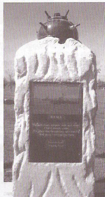
2 views of our new memorial on the day it was erected

If you are going for the Reserved Dining , the tables are circular seating 8 people. If you wish to be seated with old shipmates please signify when booking.