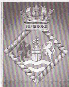
HMS Pembroke X

HMS Europa II was the overflow camp at Bungay airfield, commissioned on 25.09.1945 and paid off on 31.05.1946 when it transferred to the Air Ministry and later the RAF. HMS Europa II was set up to deal with the large number of RNPS men on demob.