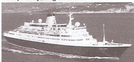
MV Saga Ruby

After progressing along on a steady course my radar eyes focused on a plaque bearing the name HMS Europa, I just could not believe my find, it was very emotional to see the plaque displayed amongst the great pride collection from around the world. I have also presented to the Captain and Officers of Saga Ruby a copy of the HMS Europa booklet to complete the history of "The Nest"