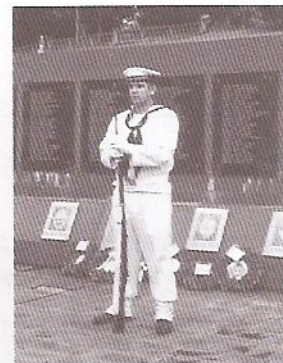
Poppy wreaths with Argentine Naval Guard at the Malvinas Memorial, Buenos Aires