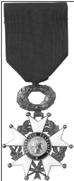
The Légion d'honneur