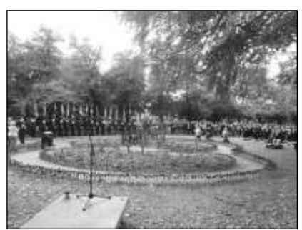
The new memorial Poppy Garden in Belle Vue Park