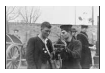
Gas mask instruction for a new recruit (HMS Europa)