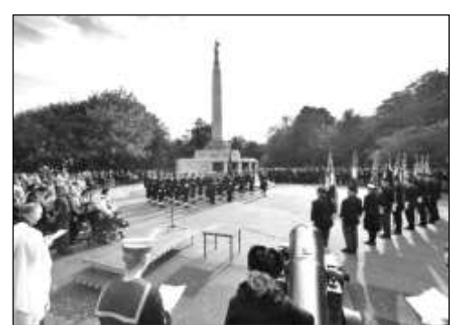
The parade formed up at our memorial