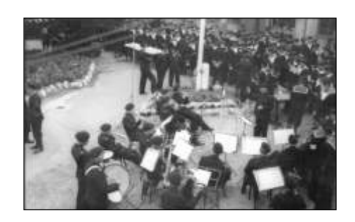
The Royal Marine Band play while the sailors queue for their rum issue (HMS Europa)