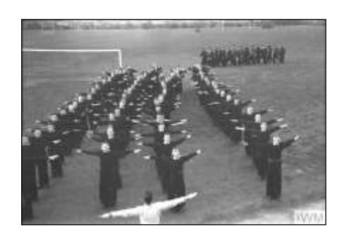
PT on The Oval (HMS Europa)

At the beginning of the war the Royal Navy had 1,400 ships, this increased with new builds, requisitioned and lease lend. The Patrol Service alone added about 6,000 to the total. By the end of the war 873,000 personnel had been in uniform under the White Ensign which included RN, RM and WRNS, they lost 63,787, roughly 7%. Of the 873,000 the Patrol Service made up 7½% but their losses amounted to 23% of the overall total. The Royal Navy today has 74 ships and 30,000 personnel.