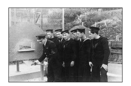
Stoker training at the Oval (HMS Europa)