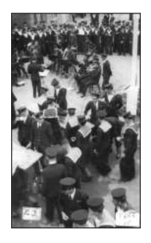
Rum being issued from the barrel (HMS Europa)