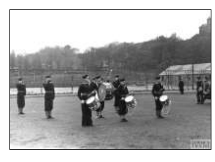
Blue Jacket drum & bugle band on The Oval (HMS Europa)