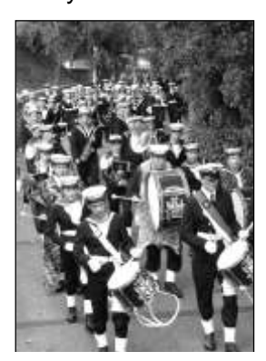
The band march up Cart Score