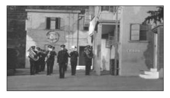
Royal Marine Band playing for divisions (HMS Europa)