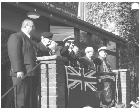
The official party take the salute at the march past