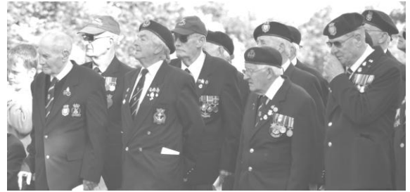
The young sailors hang on their Captain's every word