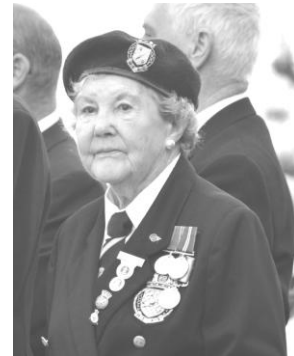
Members in reflective mood