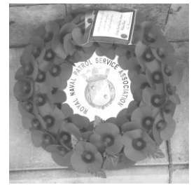
The act of remembrance