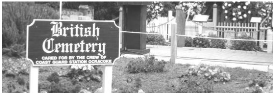
Entrance to the British Cemetery, Ocracoke