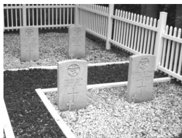
The British graves