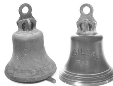
The bell before & after restoration